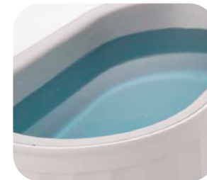
Lightly scented and tinted