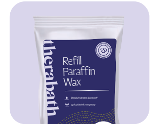
Easy-pour 1lb packages