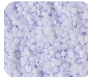
Easy-handling wax beads