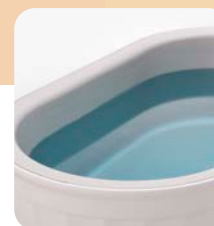
Fully Insulated, Oversized Anodized-Aluminum Tank