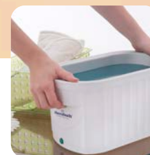
Integrated Handles Safely Increase Mobility