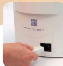
Removable IEC Power Cord