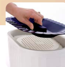
Lid with Integrated Handle